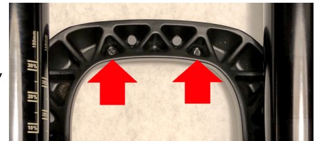
The casting code can be found on the inside of the arch web at the red arrows.